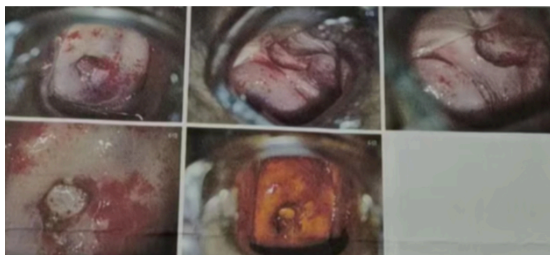
Figure 1. Colposcopic image of the patient

肿物，宫颈轻度糜烂，子宫及双附件触诊不清(见图 1)。宫颈细胞筛查未见明显异常。为了进一步明确肿物性质，于阴道镜下行肿物活检，结果考虑小圆细胞恶性肿瘤。免疫结果：CD10 (+)、Bcl-2 (弱+, 30%)、Bcl-6 (+, 90%)、MUM1 (+)、c-Myc (+, 90%)、CyclinD1 (-)、CD21 (-)、CD38 (+)、CD30 (-)、CD5 (-)、P53 (+, 80%)、Ki-67 (+, 90%)、CD79a 弥漫(+)、CD19 弥漫(+)、EBER (原位杂交) (-)、ALK (OTI1H7) (-)，符合弥漫大 B 细胞淋巴瘤，生发中心型；流式细胞学示 p53 (-)，MYC (+)，BCL2 (-)，BCL6 (-)。完善 PET/CT 显示子宫颈软组织密度肿块，向上侵及子宫体，边界不清，部分层面与临近膀胱分界不清，最大横截面约 62 × 74 mm，代谢异常增高，SUVmax 约 51.6；左侧宫旁间隙软组织密度斑片，侵及左侧附件并分界不清，代谢明显增高，SUVmax 约 23.6；左侧阴道下段局部结节状代谢增高灶，SUVmax 约 5.1，腹膜后腹主动脉左旁轻度增大淋巴结，直径约 8.0 mm，代谢轻度增高，SUVmax 约 2.5，考虑子宫颈淋巴瘤并左侧宫旁浸润、侵及左侧卵巢可能性大，同时因为肿块的压迫，她的左侧输尿管轻度梗阻，伴有轻度的左肾积水(见图 2)。骨髓穿刺未见骨髓受累。至此，患者明确诊断为子宫颈原发弥漫大 B 细胞淋巴瘤。治疗上给予患者 R-CHOP (利妥昔单抗 0.7 g，环磷酰胺 1.2 g，多柔比星脂质体 40 mg，长春地辛 4 mg，醋酸泼尼松 100 mg) 方案化疗，3 周期治疗后行 PET/CT 显示患者子宫颈肿块大软组织消失，子宫大小、形态可，左侧附件饱满，未见异常密度及异常代谢，腹膜后腹主动脉左旁淋巴结未见明显异常代谢，较前体积减小，代谢减低。随后她又完成了 4 周期的化疗。从诊断到目前我们随访 8 个月，患者症状缓解。